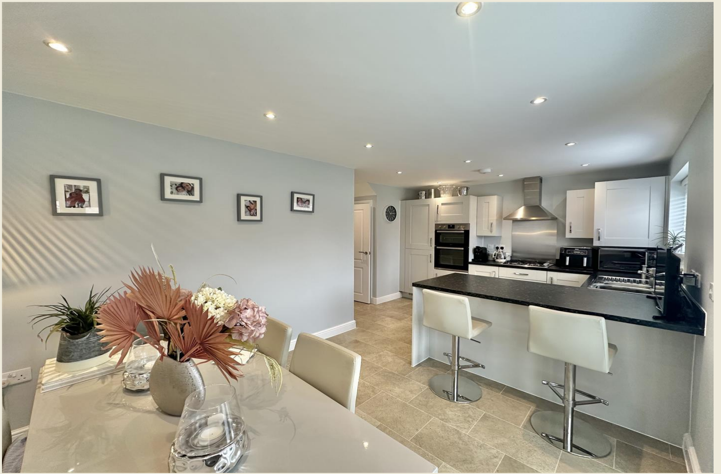
OUTSTANDING OPEN PLAN KITCHEN DINER