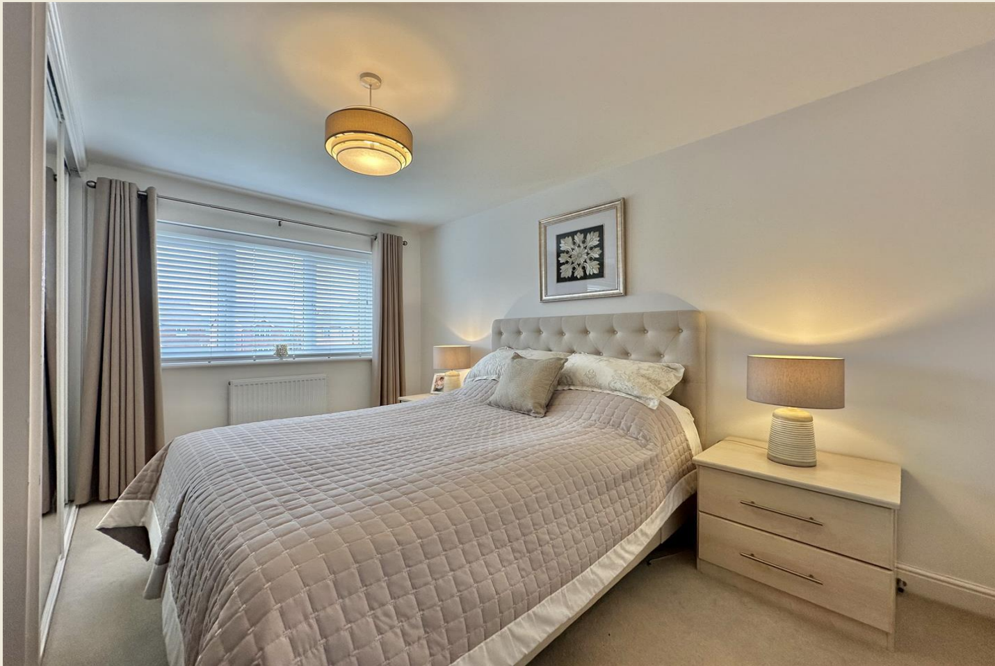
MASTER BEDROOM ONE